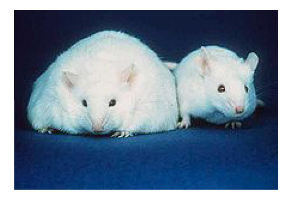
Fig. 1. A comparison of an Ob/Ob mouse unable to produce leptin thus resulting in obesity (left) and a normal mouse (right).

T.W. Nichols Jr. / Medical Hypotheses xxx (2012) xxx-xxx